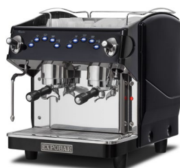
2 Group Compact