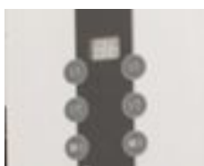
Full or half brew selection with digital display