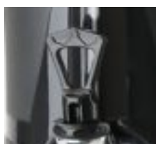
Fast draw taps on stations and hot water outlets