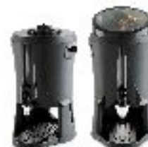
Economical extra serving stations - 1°C per hour temp drop