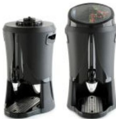
Extra serving stations with Optional display lids