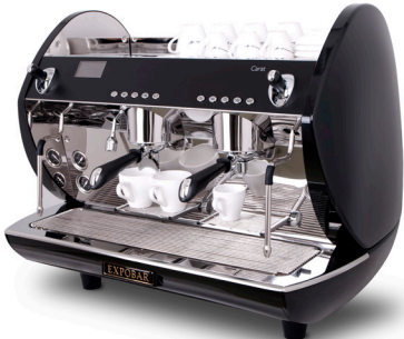
CARAT ECO 2 GROUP