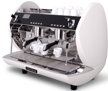
CARAT ECO 2 GROUP