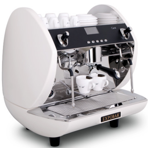
CARAT ECO MINI 1 GROUP