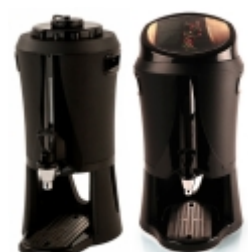
Optional extra serving stations