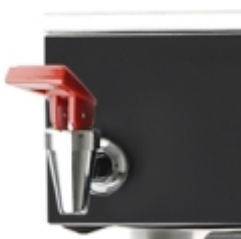
Tea water tap