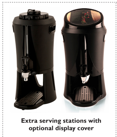
Extra serving stations with optional display cover