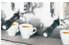
Components of the highest quality