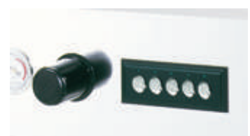
Digital Group Control