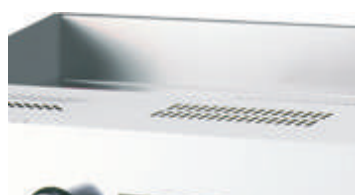
Cup tray with large capacity